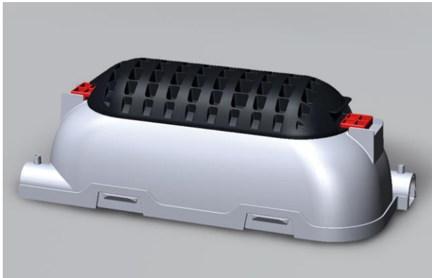
Closure for overlength 29030